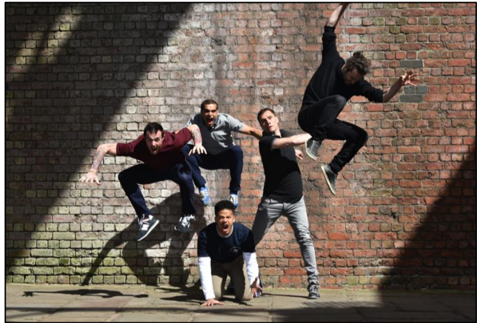
Of Man and Beast