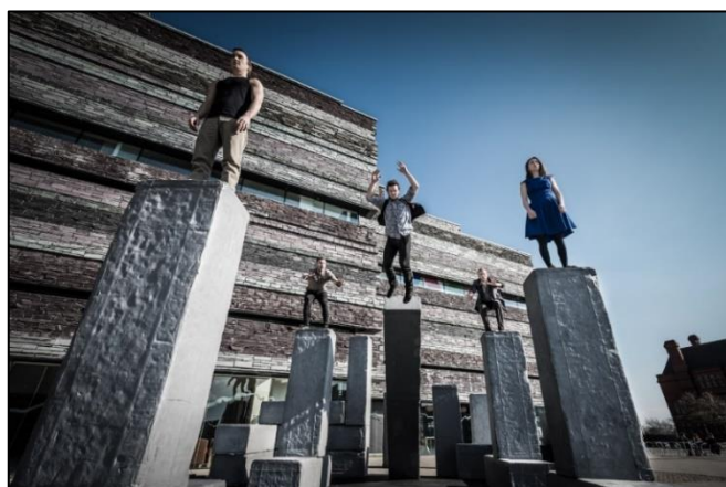
BLOCK