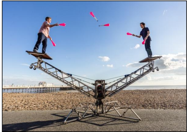
Project_Vee © Joe Clarke