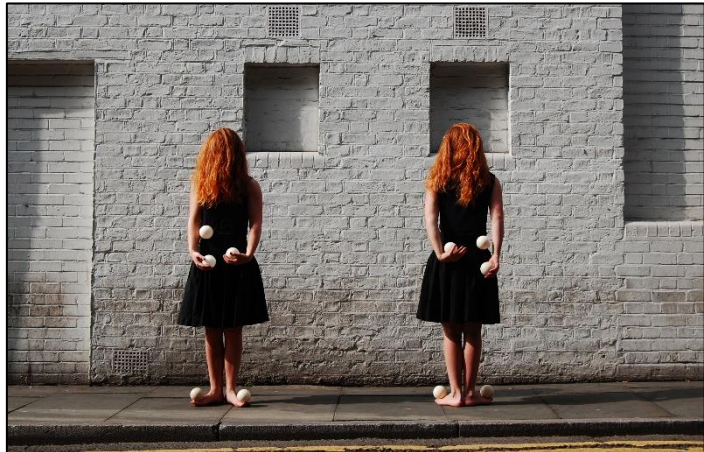
8 Songs