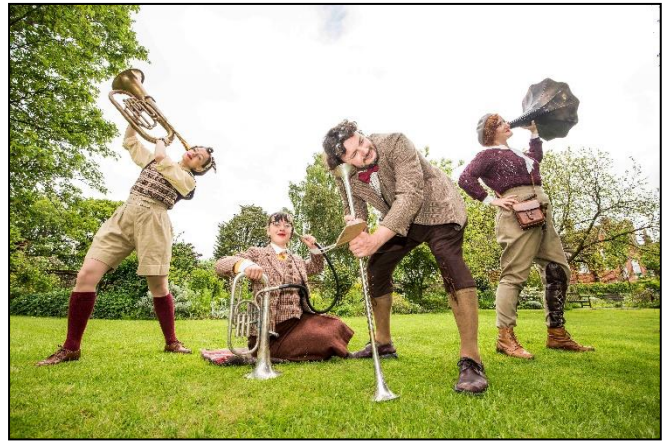
Ear Trumpet