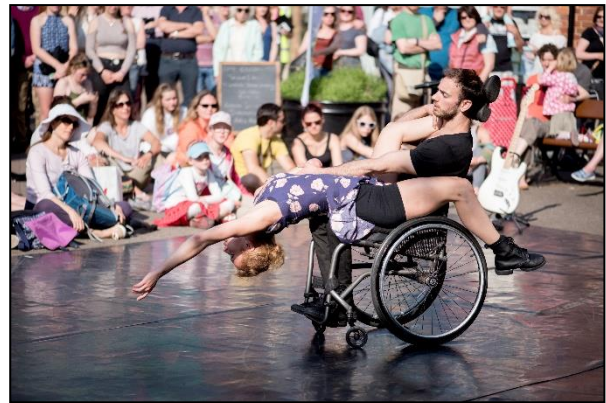
You and I Know