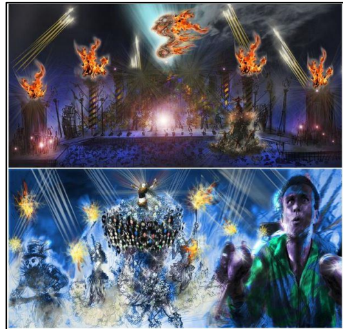
Voodoo Rising