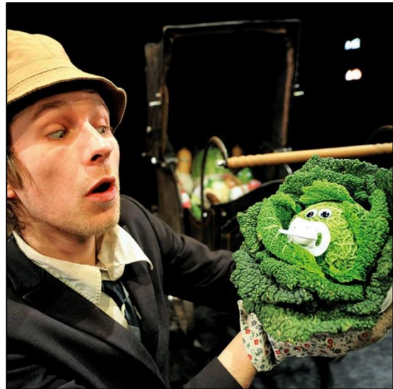
Vegetable Nannies