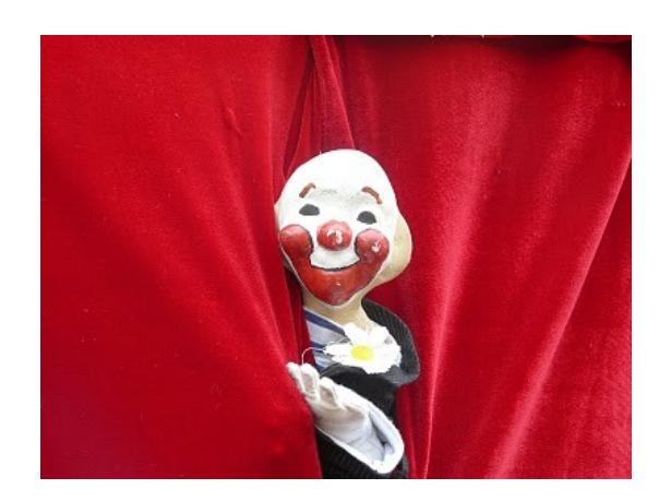
CIRCUMLOQUI Ne me titere pas