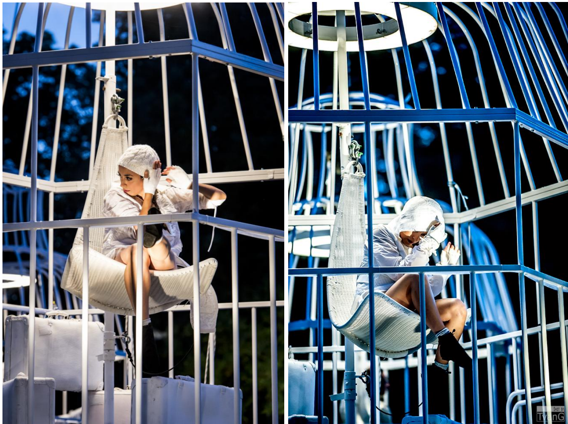
Paul Jongeneelen Photography