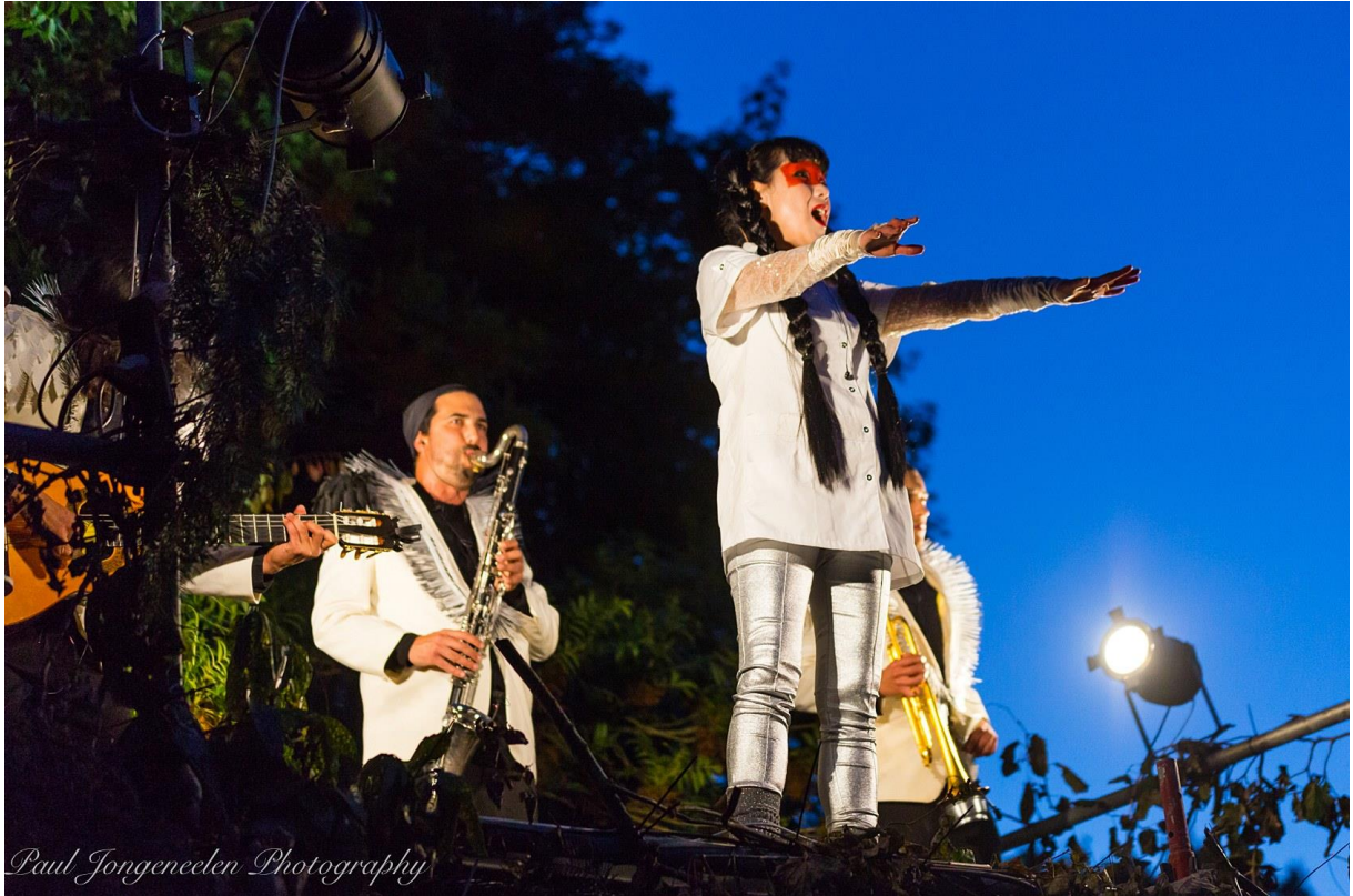
Paul Jongeneelen Photography