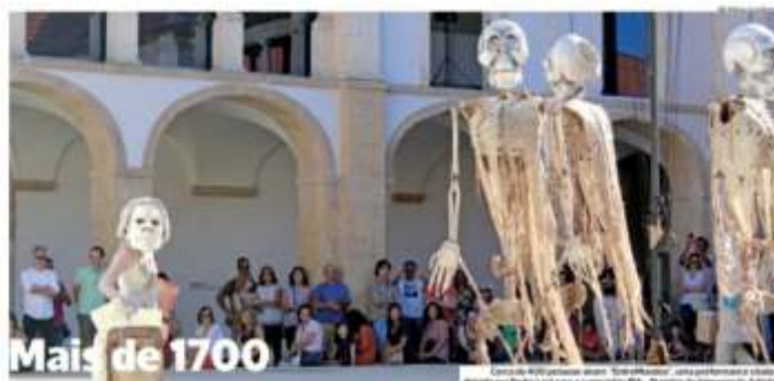
Cerca de 1700 pessoas assistiram ao espetáculo 'Entremundos' no festival CEM PORTAS, uma performance criada e dirigida por Pedro Lúcio para o convento de São Francisco.

http://projectospia.blogspot.com/2019/10/entremundos-noat-festival-cem-portas.html