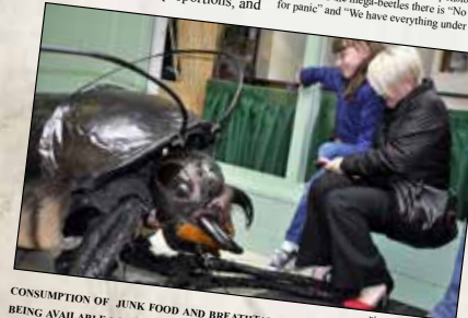
CONSUMPTION OF JUNK FOOD AND BREATHTAKING AMOUNTS OF FOOD-WASTE BEING AVAILABLE TO THESE BEETLES IN AND AROUND THE BIG CITIES IS THE CAUSE OF THEIR UNNATURAL AND PHENOMENAL GROWTH.

Concerned citizens increasingly report about the sightings of giant beetles in various cities in Europe. Widespread panic and unrest due to close encounters with these creatures are the cause of great concern amongst the population.