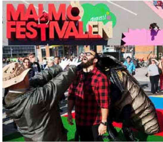
MALMÖ FESTIVALEN MALMÖ Sweden