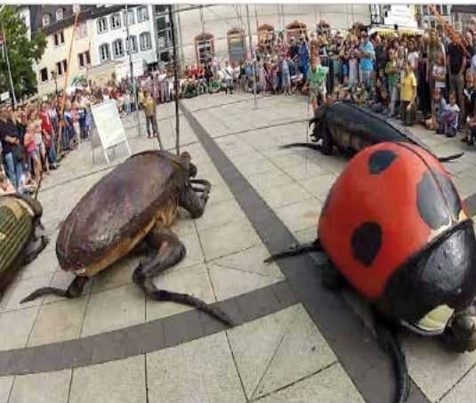
International Street Theatre Festival KOBLENZ Germany