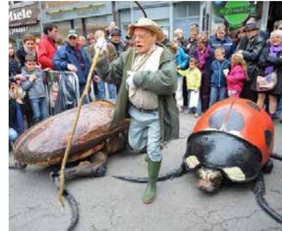
NAMUR EN MAI Festival des Arts Forains NAMUR Belgium