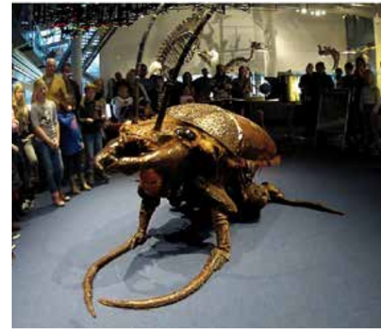
HAAGS UIT FESTIVAL DEN HAAG, Netherlands