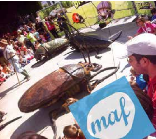
MAF Muestra Intern. de Artes Fantásticas SANTANDER Spain