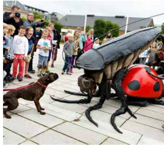
AARHUS FESTUGE AARHUS, Denmark