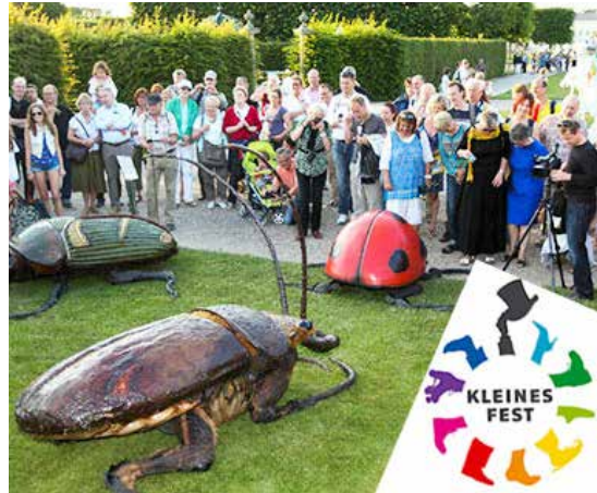
International Festival KLEINES FEST... HANNOVER Germany