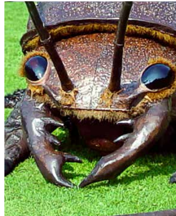
TOP Rudolf the Cockroach LEFT Fido the Stag Beetle UNDER Conchitta the Ladybug BOTTOM LEFT Priscilla the Jewel Beetle BOTTOM RIGHT Gunther the Forester