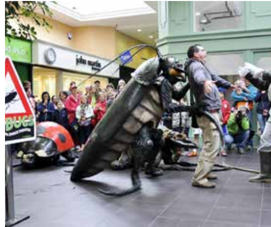
SPRAOI International Street Arts Festival WATERFORD Ireland