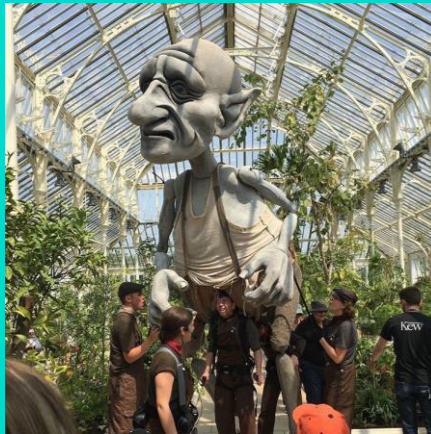
Gnomus at the Temperate House, Kew Gardens 2018