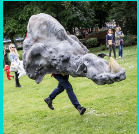
Rampaging Rhinos at Wandsworth Fringe 2016

Check out more of our work at puppetswithguts.com/shows/