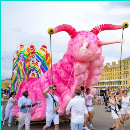
Snail at Brighton Pride 2019