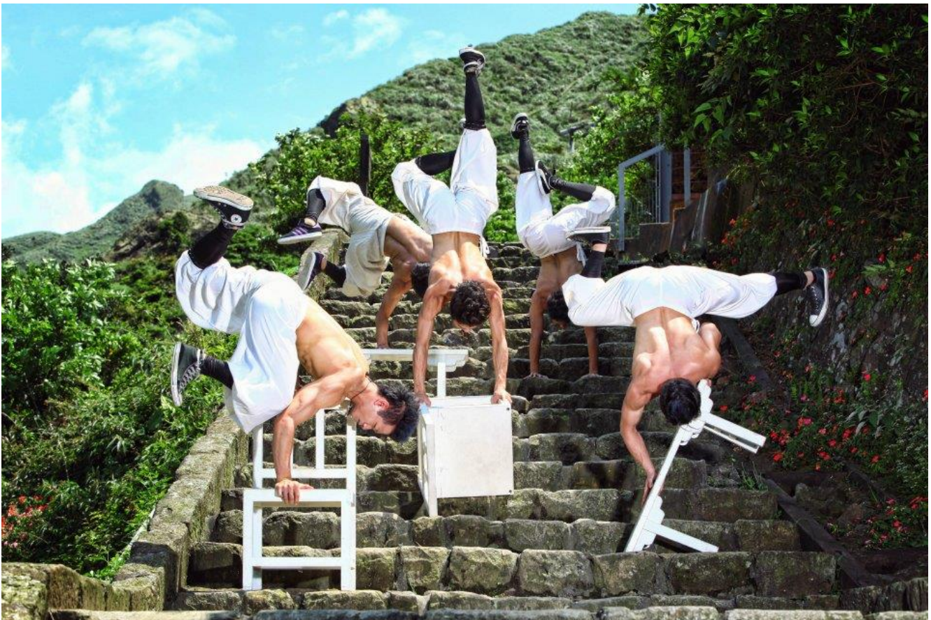
Formosa Circus Art, Taiwan

Taipei Arts Festival is organised by the Taipei City Government and Taipei Culture foundation, presenting a series of themed performances at sites across Taipei www.artsfestival.taipei