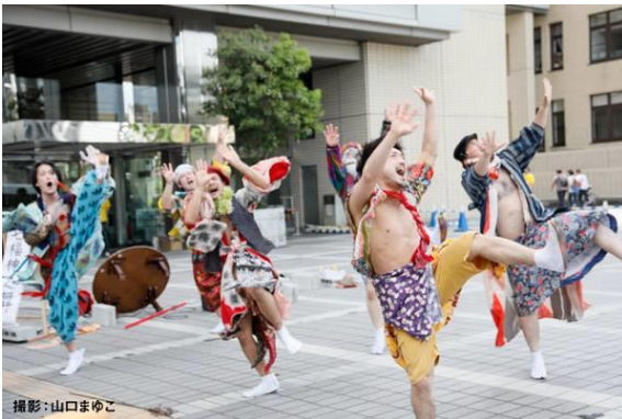
Short-range Man Road Missile, Strange Seed festival

Dadigoei World Cup in Shizuoka is a well known street arts and busking competition taking place every year in November www.daidogei.com