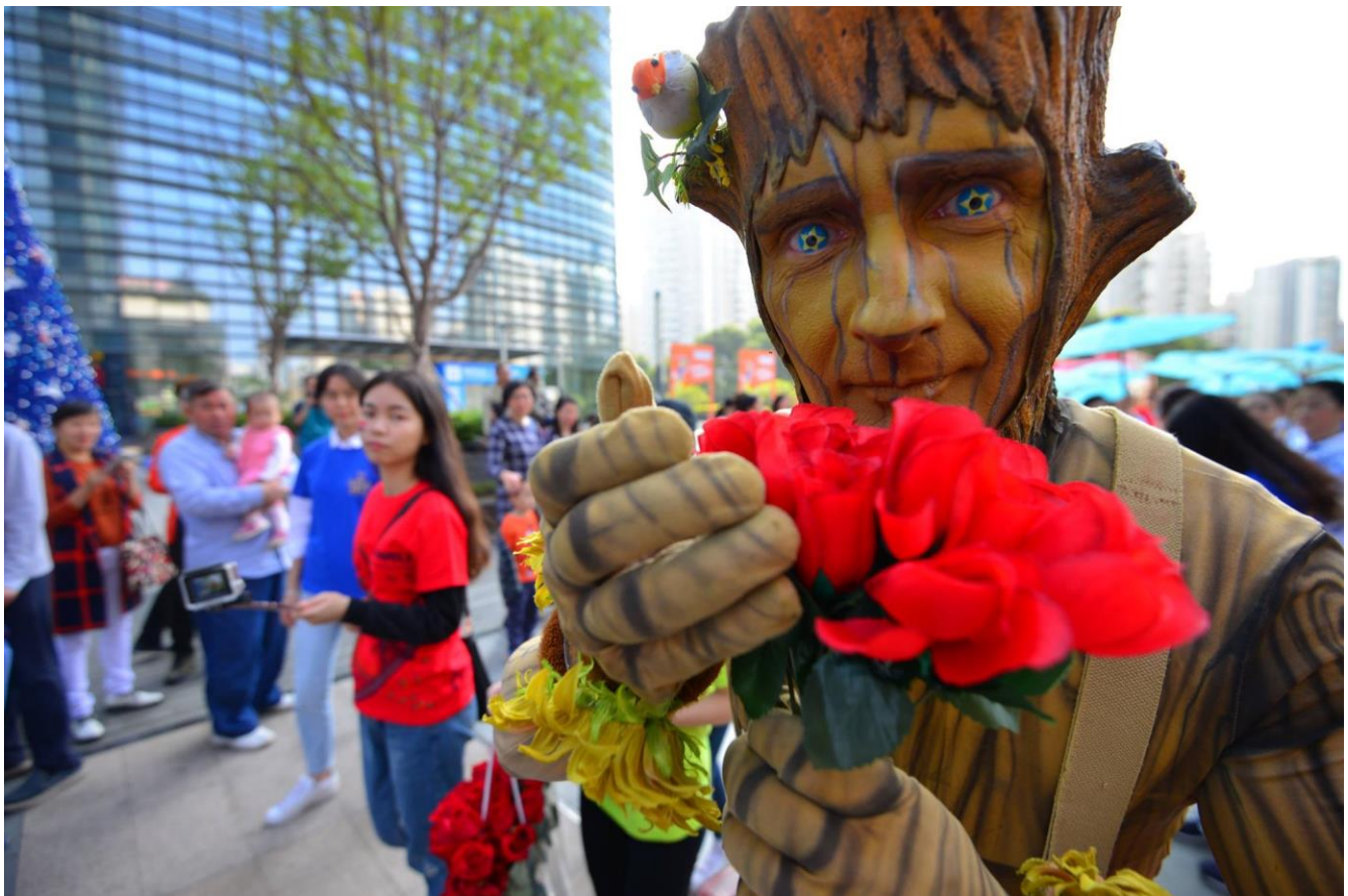
Shenzhen Fringe Festival

China Residencies maps, researches and presents a free online directory of residency opportunities in mainland China and Hong Kong across all artforms and disciplines, as well as advising organisations on starting and running residency programmes. www.chinaresidencies.com