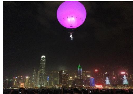
s.l.o.a.p by Branch Nebula & The Heliosphere as part of Freespace Fest