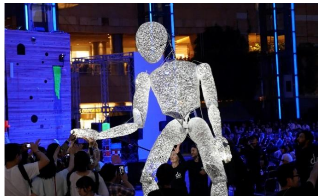
Dundu at Roppongi Night Festival

“Japan has a rich and diverse cultural heritage, whilst, at the same time, leading the world with advanced technology and innovation, which is reflected within Japanese contemporary culture”