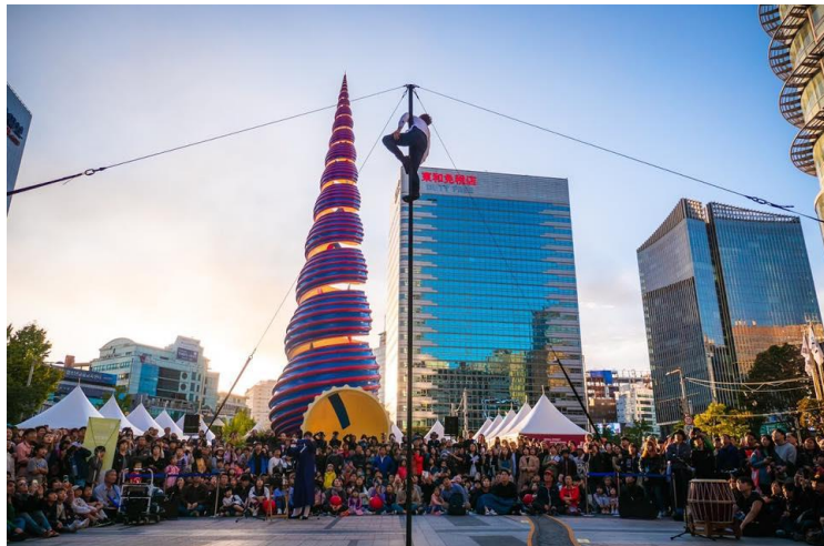
Bongnjoule, Seoul Street Arts Festival

Now in its 23rd edition, Suwon Theatre Festival focuses on the arts in public space and unconventional theatre and is held in the end of May. Under the slogan of “Party in the forest”, it takes place in the wooded Gyeonggi Sangsang Campus www.swcf.or.kr/stf/english/