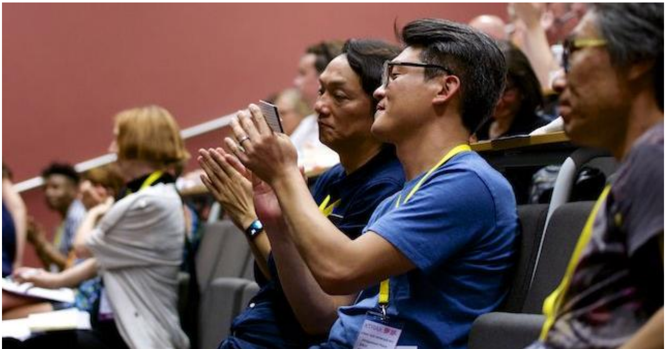
Focus on South Korea as part of our XTRAX/GDIF showcase 2017